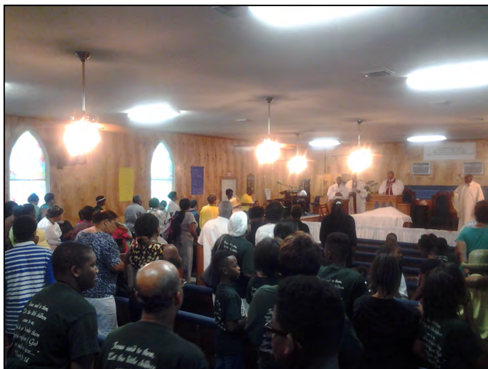
2015 Lay Leadership & Training Convention